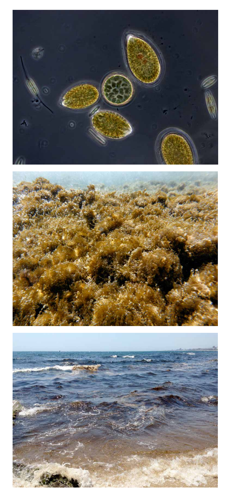
FIGURE 3. (top) Light micrograph of a natural sample of the benthic harmful dinoflagellate Ostreopsis cf. ovata from the Gulf of Naples (Mediterranean Sea). (middle) Dense mucous carpet containing high densities of Ostreopsis cells covers the macroalgal community. (bottom) Water motion and internal life processes release cell aggregates that can be found at surface.

The objectives of this theme are to determine the links between marine aquaculture and HAB occurrence in different regions and to find efficient methods for protecting farmed seafood products from HAB impacts. Shellfish and finfish aquaculture has many benefits, including the creation of nutritious, high-protein food; reducing pressure on natural resources; and supporting sustainable economic development and employment. However, because of the improved awareness and identification of HAB events that have occurred alongside increases in aquaculture developments, it is important to determine whether aquaculture may cause and/or increase the intensity of HAB occurrences. Through focused studies and improved observational methods, this theme will seek to provide fresh perspectives for assessing the potential effects of nutrients, shifting nutrient ratios, and/ or organic matter produced by aquaculture in the promotion