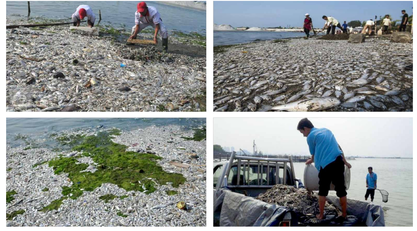
FIGURE 6. Massive fish mortalities in Jakarta, Indonesia.

HABs, and many studies on the negative economic impacts of HABs have employed relatively crude measures and methodologies whose results are difficult to compare (Davidson et al., 2014). The economic effects of HABs arise from public health costs, commercial fishery and aquaculture operation closures and fish kills, possible medium- and long-term declines in coastal and marine recreation and tourism, and the costs of insurance, monitoring, management, and mitigation (Morgan et al., 2010). Aggregating economic effects-both within and across these categories-can also be problematic with available data and currently used methodologies (Hoagland et al., 2002). An example of an economic evaluation of HABs at a national level is given by Anderson et al. (2000), who estimated the economic effects of HABs in the United States to be $100 million per year (as later translated into 2012 dollars), broken down as follows: 45% for public health costs, 37% for the costs of closures and losses experienced by commercial fisheries, 13% from the impact on lost recreation and tourism opportunities, and 4% from