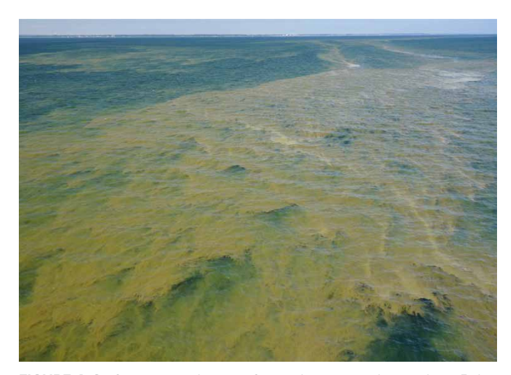
Sea in 2013.

The overall objective of this topic is to increase collaboration among HAB scientists with medical, veterinary, public health, and social science expertise to help minimize the risk of HAB impacts to human and animal health. This theme aligns with other initiatives in the United States and Europe that highlight the need for integrated understanding of the health and environmental