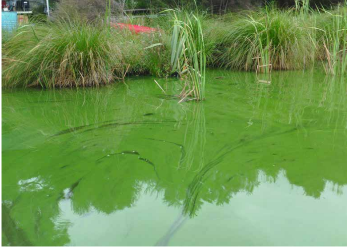
FIGURE 4. Surface accumulations of cyanobacteria in the southern Baltic FIGURE 5. Bloom of the toxic cyanobacterium Microcystis in a New Zealand lake.